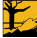
Dangerous for the environment